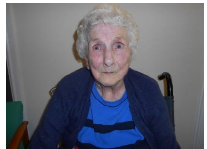
B.L Looking lovely

Eira jones is still coming every week on wed to pamper our ladies gentleman which they love.