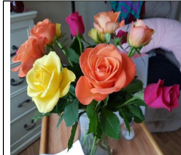
Roses for Pamela