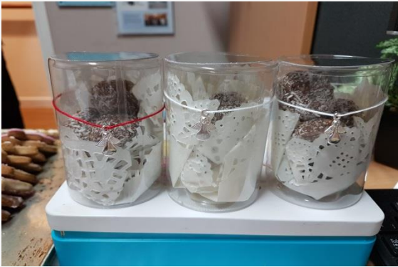
Sylvia's Angel Chocolates