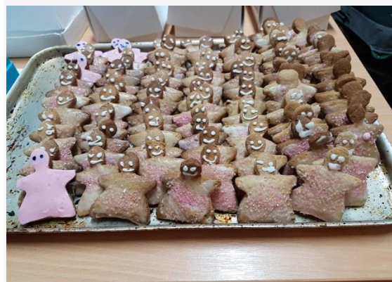
Duncan's Angel Biscuits